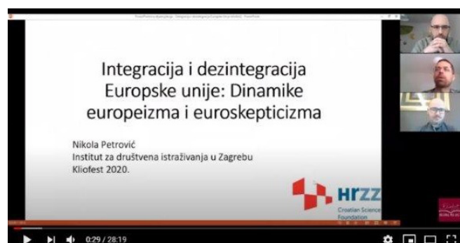
Presentation of the CSF project IDEU at Kliofest – Festival of History