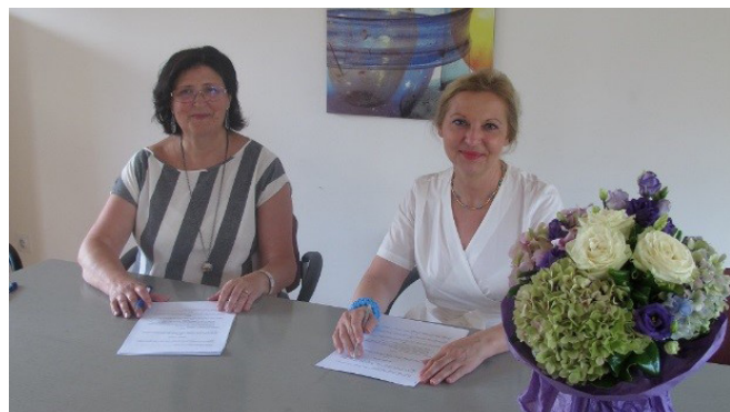
Signing of the collaboration agreement between ISRZ and the Education and Teacher Training Agency