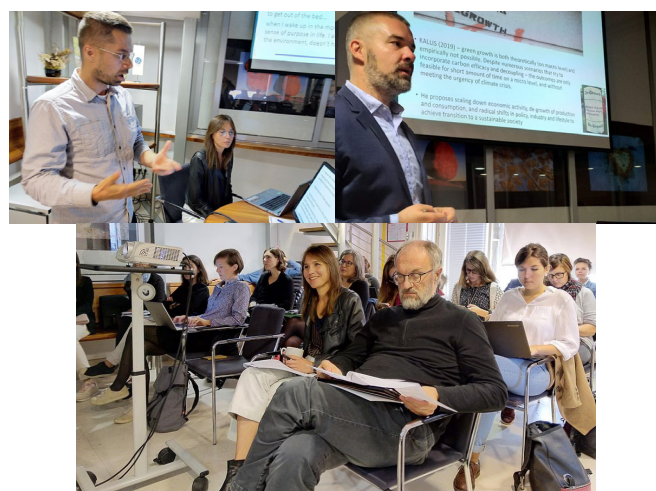
International conference Transforming Sustainability held in Ljubljana