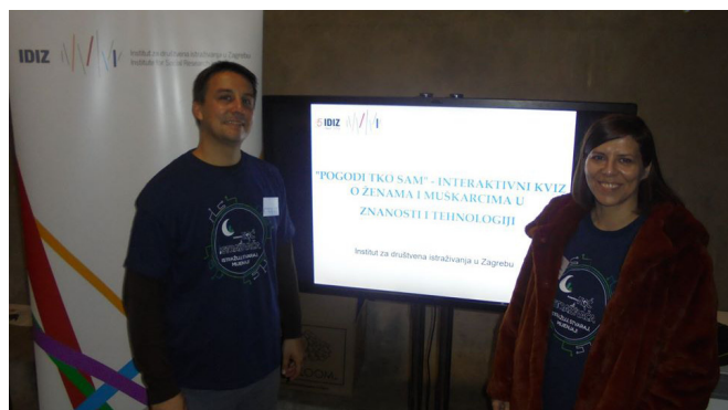
European Researchers' Night

The European Researchers' Night was held on Friday, 27 th September 2019 in four Croatian university cities: Zagreb, Rijeka, Split and Osijek. The event was organized and financed as part of the activities within the Horizon 2020 Marie Skłodowska Curie project "Techno Past – Techno Future" , which was implemented with the aim of bringing the work of scientists closer to the broader public and raise awareness on the importance of science and scientific discoveries for everyday life. The Institute participated in the programme with an interactive quiz on women and men in science "Guess who I am?" aimed at questioning the prejudices and established ideas on the "image of an average scientist". Besides participating in the presentational part of the programme, the Institute conducted a comprehensive questionnaire survey in all four cities, which aimed to explore the attendees' attitudes on science and scientists, impressions on the programme quality and interest for similar programmes of science popularization.