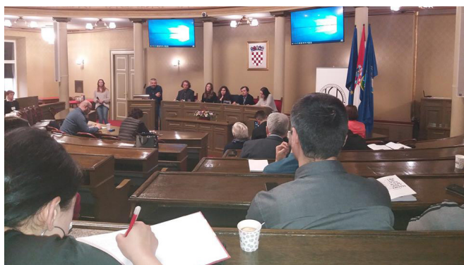
7 th National Sociological Congress of the Croatian Sociological Association