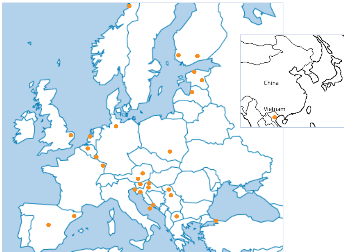
Map 1. International conference presentations in 2019