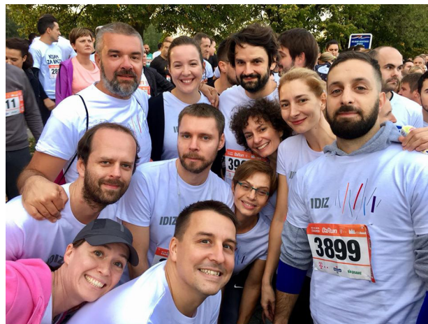
ISRZ staff at the HT B2B Run held at Jarun Lake in Zagreb