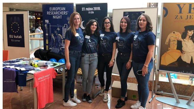
European Researchers' Night