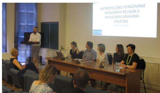
Presentation of the UKF project held in Mimara Museum in June 2019