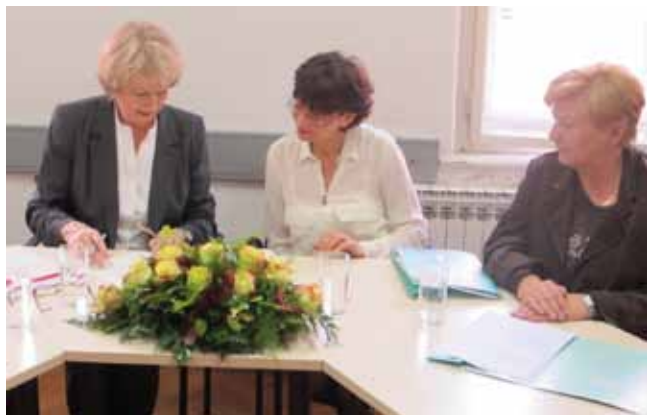
Signing of the agreement

The aim of this initiative is the establishment of cooperation model of the institutions involved in the development of higher education in South Eastern Europe, with the task of encouraging and improving the quality of tertiary education, creating a network of institutions and individuals involved in this type of research, the establishment of a database, as well as professional and consulting activities related to the adoption of educational policies and their implementation.