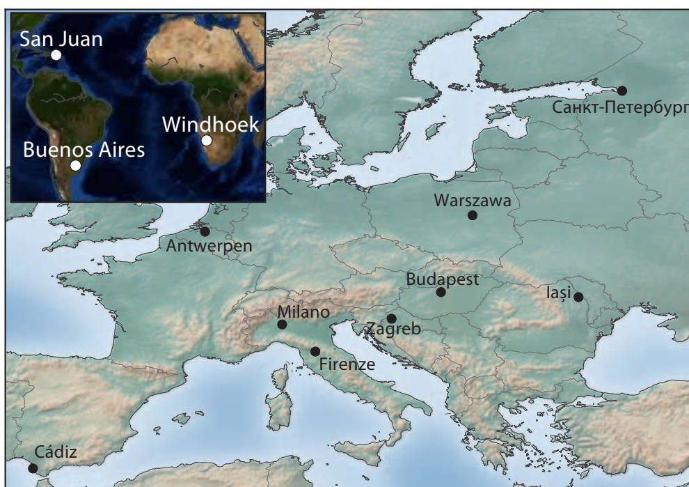
Participation of IDIZ employees at the European and world conferences

Employees of the Institute actively participated in numerous scientific and professional conferences at home and abroad. In addition to local meetings in Zagreb, Zadar, Šibenik and Split, employees have participated also at gatherings in Buenos Aires, San Juan and Windhoek, as well as the European conferences that can be seen on the map below.