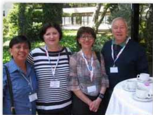
Photos from ISSP Cavtat conference

Five-day meeting was joined by more than 80 researchers from 40 countries that in a series of successful meetings completed the questionnaire for research module National Identity , and discussed some important issues associated with the future module called Citizenship . At the end of the meeting members of the project gave Croatian members of the ISSP project a great honor by electing Croatia (IDIZ as a representative) in the Standing Committee of the ISSP project.