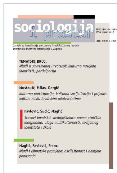
Sociology and Space No. 3 (225)