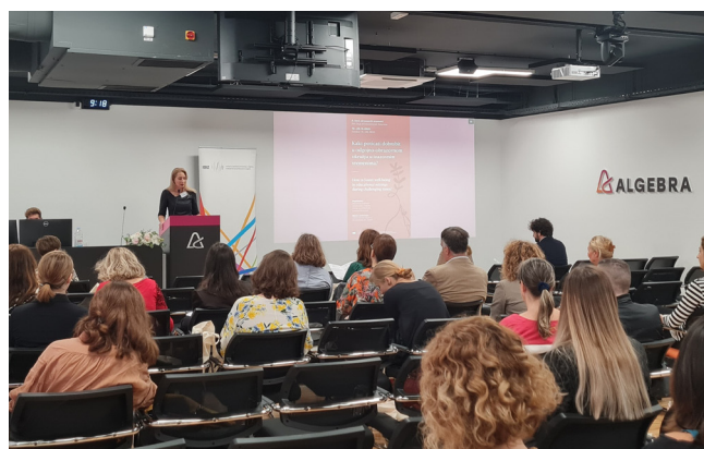
5 th Days of Educational Sciences