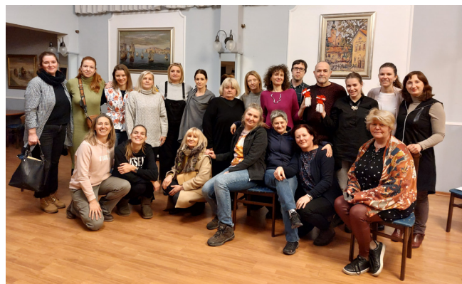
Hand in Hand - teacher training

Within our HAND IN HAND project, the ISRZ trainer teams carry out the program of professional and personal development for nearly a hundred teachers from 9 primary schools participating in the experiment: Primary Schools Gračani, Središće, Prečko and Voltino from the City of Zagreb, Primary School Milan Lang Bregana, Primary School Velika Mlaka from Velika Mlaka, Primary School Ljubo Babić Jastrebarsko, Primary School Samobor from Samobor and Primary School Josip Zorić from Dugo Selo. Intensive practical work, consisting of 11 meetings with teachers, organized throughout the whole school year 2022/2023, is accompanied with a shorter program of sensibilization of principals and school professionals for the topics of socio-emotional competences and diversity awareness.