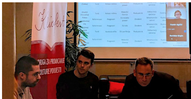
Scientific colloquium “Power of Memory Politics: History in Public Space 2022”