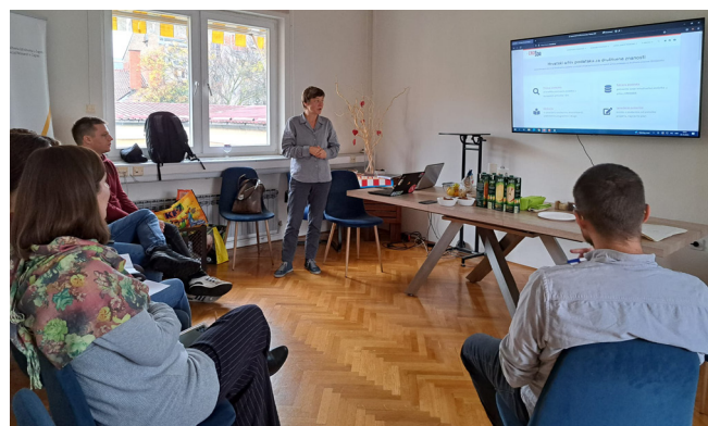
CROSSDA - Workshop on science data archives