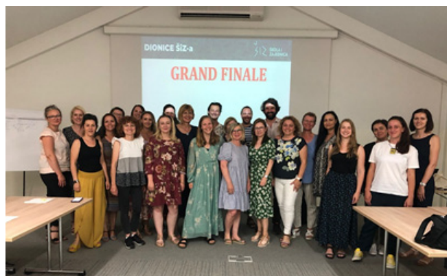
“School and Community“ - Education workshops