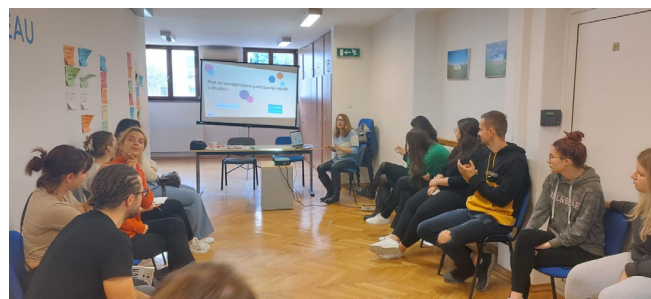
Youth training within the UNICEF project