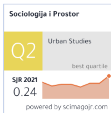
Sociology and Space for the first time in Q2