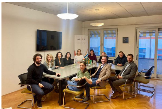
ISRZ and IPST meeting