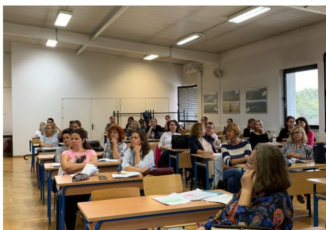
“School and Community” school staff education