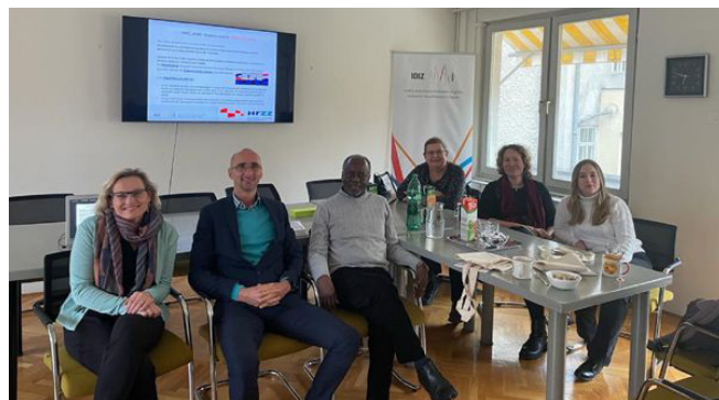
Meeting with Slovenian colleagues within HESC project