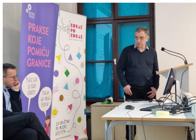
REYN Croatia conference