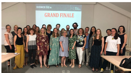
School and Community education for teachers