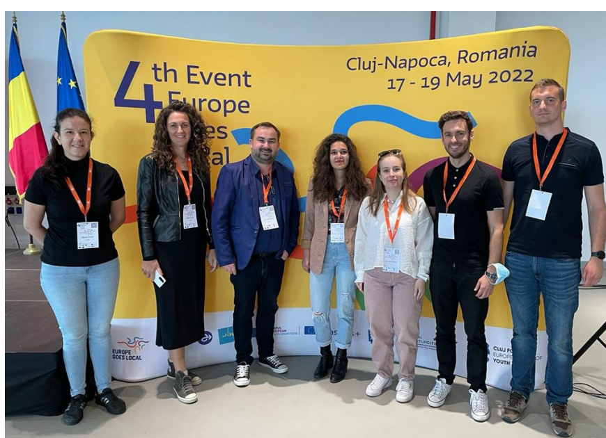
4 th European Event of the project Europe Goes Local (Cluj-Napoca in Romania)