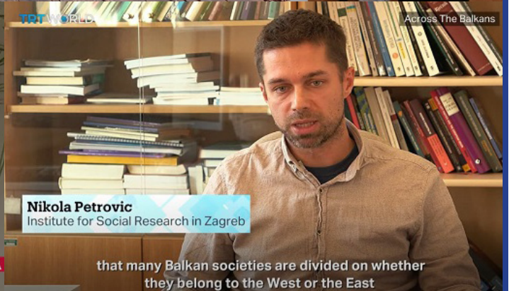
Nikola Petrović Institute for Social Research in Zagreb

that many Balkan societies are divided on whether they belong to the West or the East