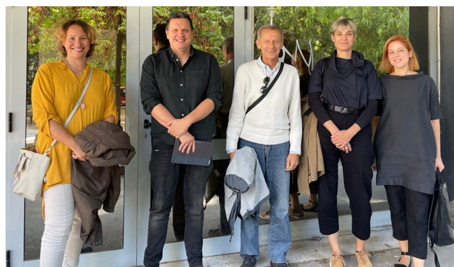
Field research of socialist and post-socialist housing estates in Split within the HESC project

In the first half of 2022 the Institute conducted 4 projects financed under the Ministry of Science and Education (MSE) Program Agreement for multi-year institutional financing of scientific activity (VIF). These projects are listed in Table 4.