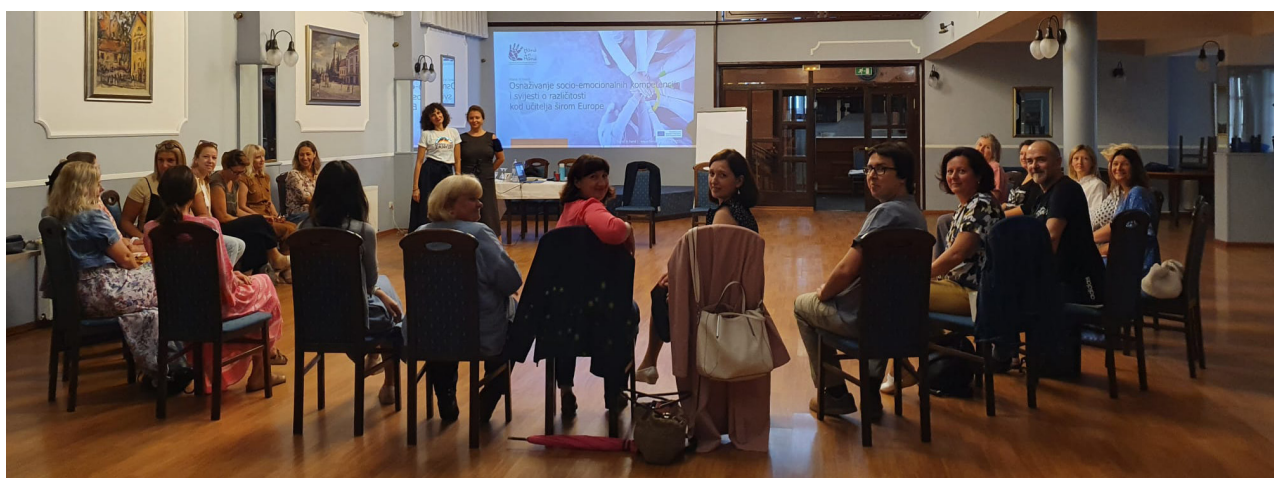
HAND in HAND Training for teachers