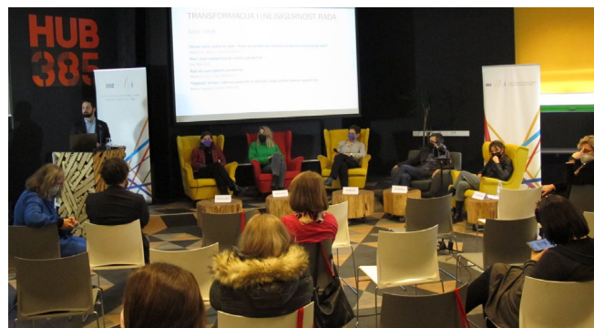
Symposium 'Social resilience: lessons from the Croatian context during the pandemic'