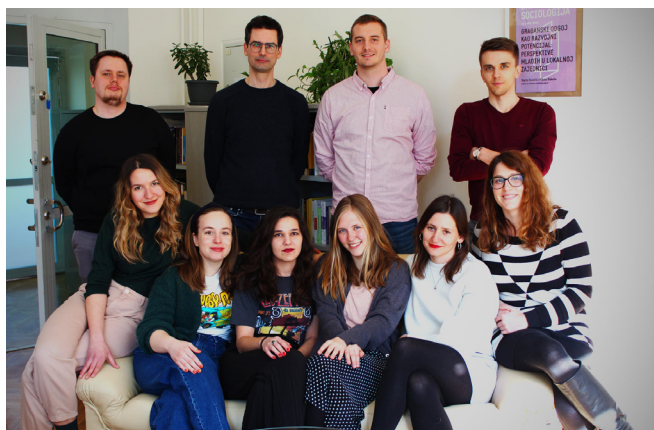
ISRZ Personnel Reinforcement