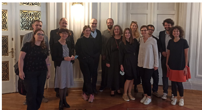
20th anniversary of the Centre for Educational Research and Development

Symposium "Social resilience: lessons from the Croatian context during the pandemic" , organized by ISRZ, was held on 14th December 2021. It gathered researchers of different profiles who offered to the public their insights on the effects of the pandemic on the society. The results of social sciences research projects financed under the Croatian Science Foundation COVID-19 calls were presented at the Symposium, along with other valuable research endeavours. Researchers from various Croatian HE institutions and public institutes opened in their presentations and discussions the questions of resilience and vulnerability of the society and individuals, of social recovery, of life taking place online and offline, and of the psychosocial benefits and mental health of individuals and various social groups. The recording of the very well attended Symposium is available at the link .