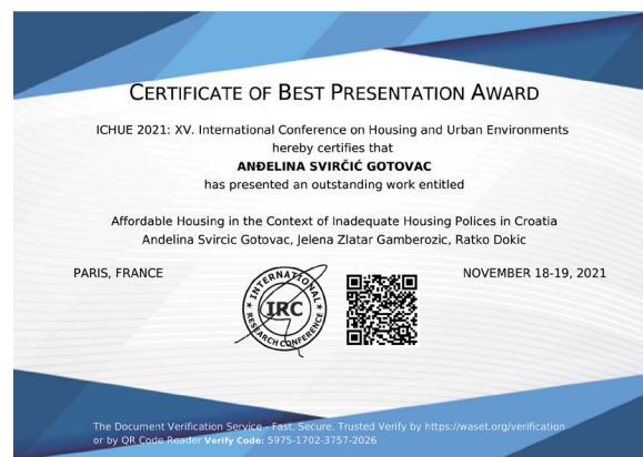
Certificate of Best Presentation Award to HESC Team

the CSF project " Quality of living in the Housing Estates of the socialist and post-socialist era: a comparative analysis between Slovenia and Croatia ".